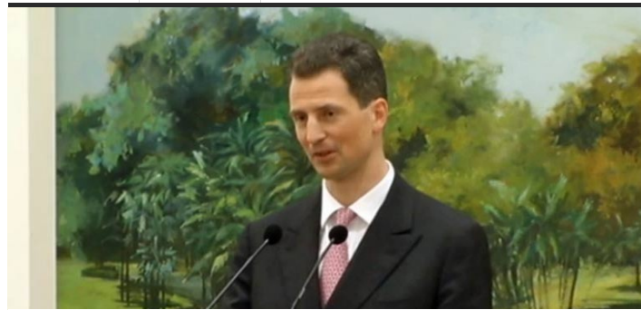
The Crown Prince of the Principality of Liechtenstein is in Singapore for an official visit. This is Prince Alois' second official visit to Singapore.